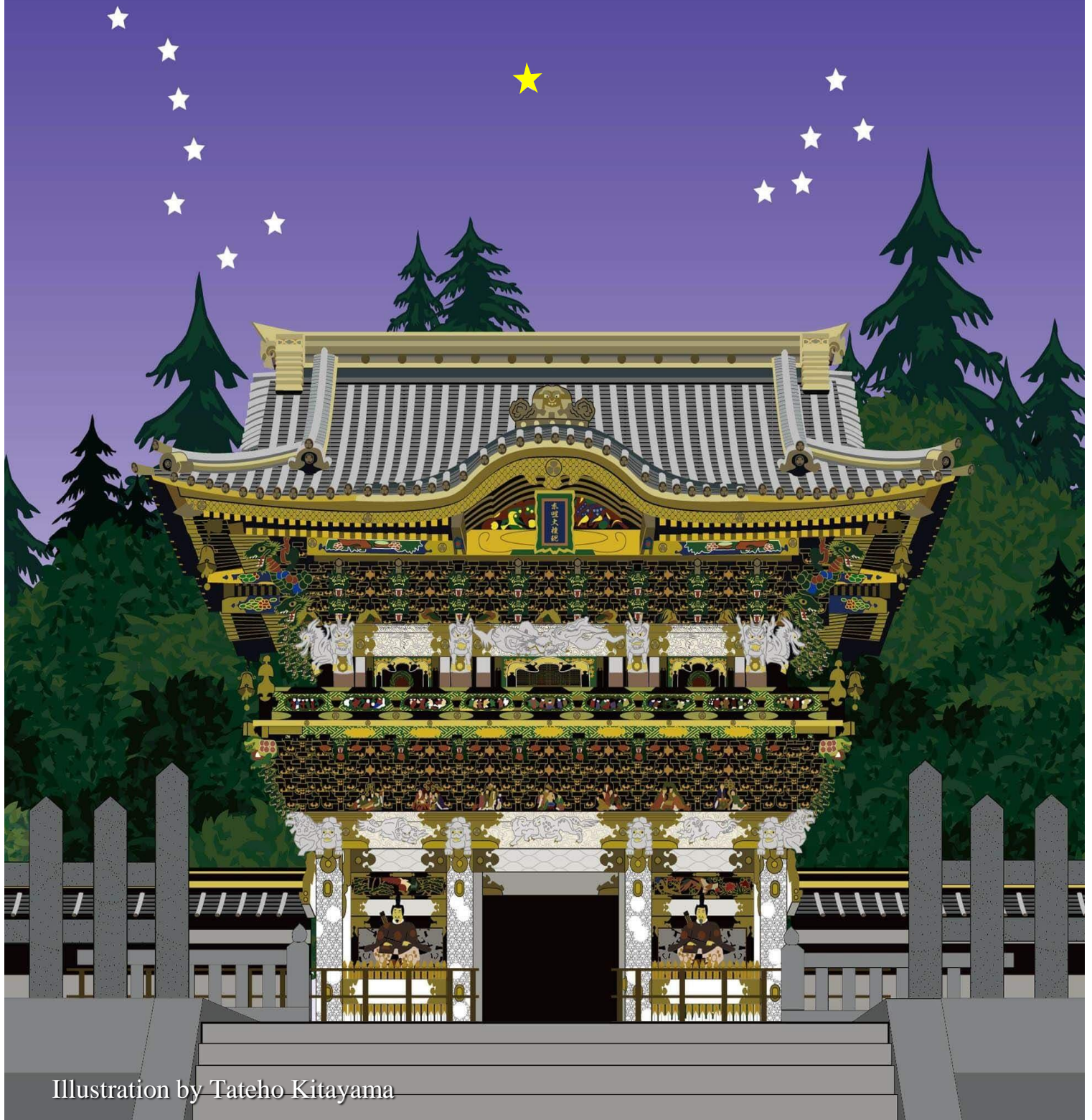
Illustration by Tateho Kitayama